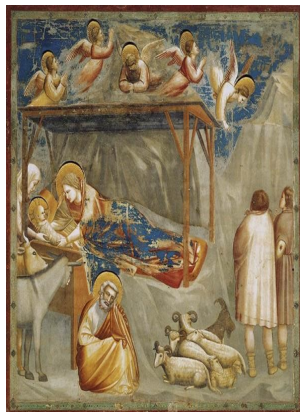
Giotto, Scrovegni Chapel, Padua